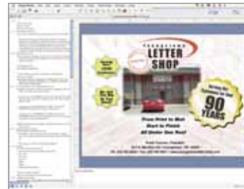
Power Point Presentations